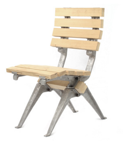
Recycled aluminum parts Stainless steel screws and fixations Available Wood types: Spruce, Beech, Iroko

For security, a hole can be drilled in the flat surface of the legs to be able to fix it to the ground.