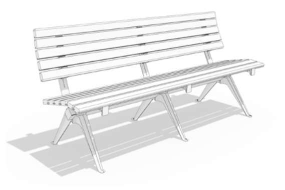
02.c - Bench for five