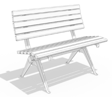
02.b - Bench for two