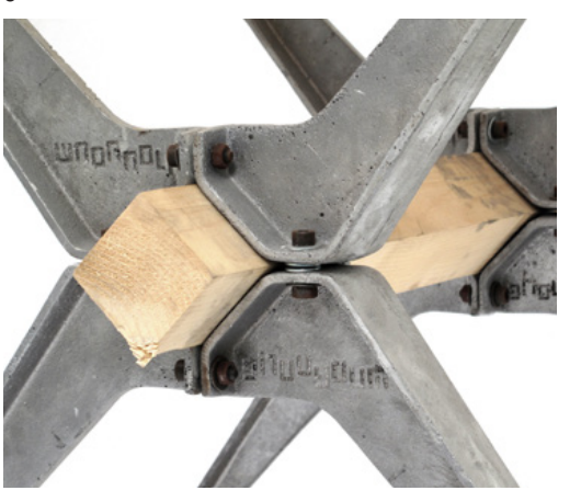
Recycled aluminum parts Stainless steel screws and fixations Available Wood types: Spruce, Beech, Iroko

For security, a hole can be drilled in the flat surface of the legs to be able to fix it to the ground.