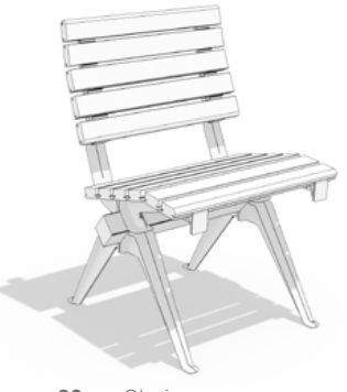
02.a - Chair